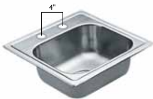
2-hole 4" centers

Allows for a one-piece faucet set with a single lever or a faucet with a side handle.