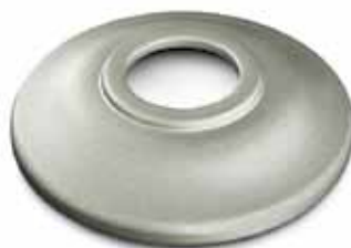
Classic Brushed Nickel