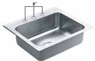
3-hole 8" centers

Offers the option of installing a one-piece faucet set with a side sprayer or soap dispenser or a one-piece faucet with separate handles.